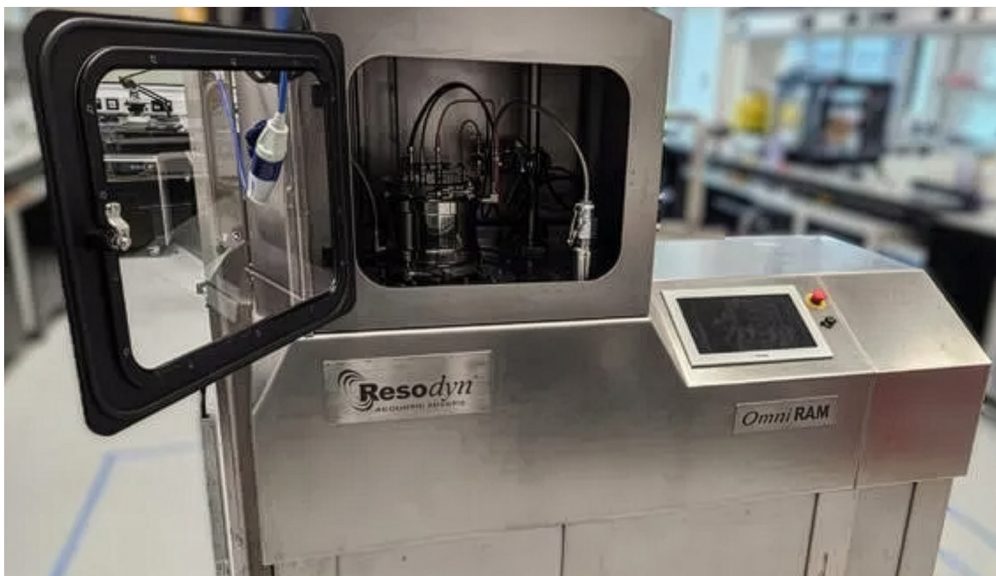
OmniRAM installed for scale up testing and industry collaboration at the Birmingham Centre for Mechanochemistry and Mechanical Processing.

The breadth of the research program reflects the spectrum of RAM's applicability. From materials science to catalytic synthesis to pharmaceutical amination, the same platform delivered consistent advantages across fundamentally different chemistry. That consistency is what the ACS recognized.