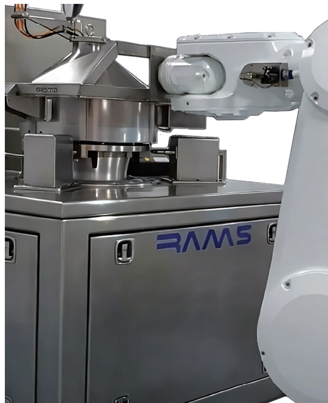
Resodyn integrated Catalent’s preferred robotic arm to automate loading/unloading.

capability and solvent-free processing directly unlocks higher API potency — enabling the up to 4X increase in drug load that the next-generation ODT platform delivers. [1]