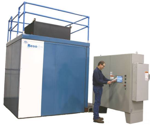
Figure 1. Resodyn 30-gallon industrial scale ResonantAcoustic ® Mixer.

RAM technology is currently used to mix powders, liquids and highly-viscous pastes using the LabRAM bench-top scale mixer (0.5 kg) and the RAM 5, 5-gallon mixer. The scaled up RAM 55, with a 55-gallon capacity, mixer is currently in design and due to be offered for sale in the second quarter of 2010. A 30-gallon RAM, which was used to conduct this work at Resodyn, is shown in Figure 1.