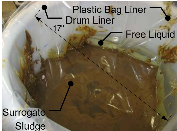
Figure 3. 200,000 cP surrogate sludge plus 2.6-gallons of free liquid.

The starting condition, Figure 3, is a base matrix of 200,000 cP surrogate. An additional 11-percent by volume liquid oil and volatile organics was split between the bag, liner, and the surface of the sludge. This mix of ingredients simulates a 55-gallon drum containing over 4.8-gallons of free liquids and, like the drum, has approximately 20-percent headspace.