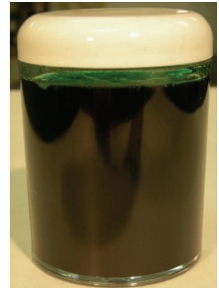
After 5 Seconds Mixing